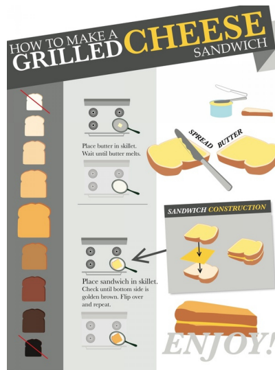
Figure 3: Example of User Guide

A very simple user guide will be provided within the program under a 'Help' menu. This user guide will be a short series of images and text descriptions showing how to load a GIF, select a playback speed, select a subset of frames, and export these frames to a desired location on the user's PC. It will follow a format similar to below. [Figure 3] This user guide will be completed by a developer once the application is finished. This document will be updated to include the user guide when it is completed.