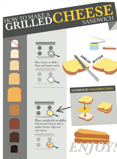
Figure 3: Example of User Guide